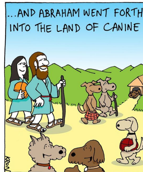
The CARTOON KRONICLES

Aranui Bike Fixup is operating at Breezes Road Baptist Church every Thursday 3-6pm. Contact Steve on 0210619296